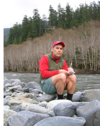
Craig Romano on Quinalt's North Fork

Tuesday, January 12, 2010 7:00 Social; 7:30 Program Padilla Bay Interpretive Center 10433 Bayview-Edison Road Mount Vernon, Washington