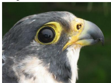
Peregrine Falcon

During an hour of lecture and an hour of slides, we cover the basics of hawk biology, including their distribution, annual cycles, hunting behaviors and much more. We always put a strong emphasis on field identification. The class meets two hours each week for five weeks and covers a different group of raptors each night. We conclude with a full day winter field trip to the Skagit Flats to observe a wide variety of raptors in the wild. Cost of the 5 week class is $135.00.