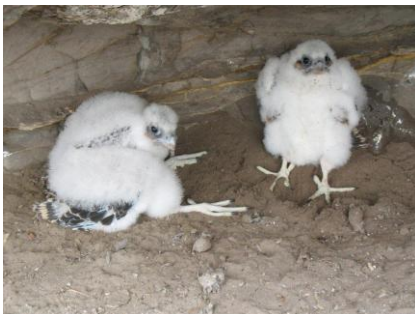
Young San Juan Peregrines