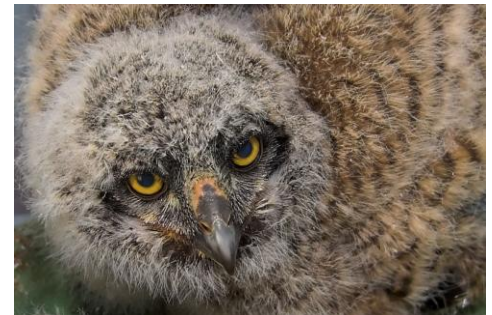
Great-horned Owl Fledging