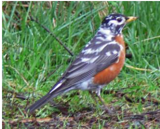
Leucistic American Robin

Mountain Bluebird 10 at Cockreham Island on 3/26 & 27 (GB)