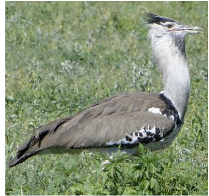
Kori Bustard in Ngorongoro Crater

Tuesday, September 14, 2010 7:00 Social; 7:30 Program Padilla Bay Interpretive Center 10433 Bayview-Edison Road Mount Vernon, Washington