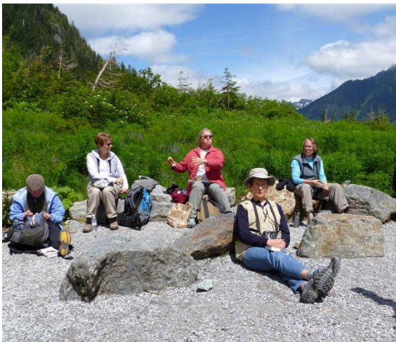
Lunch Time, June 22 nd , Big Four Mountain Birding Field Trip

http://www.vauxhappening.org/Vauxs_Happening/Vauxs_Happening_Home.html