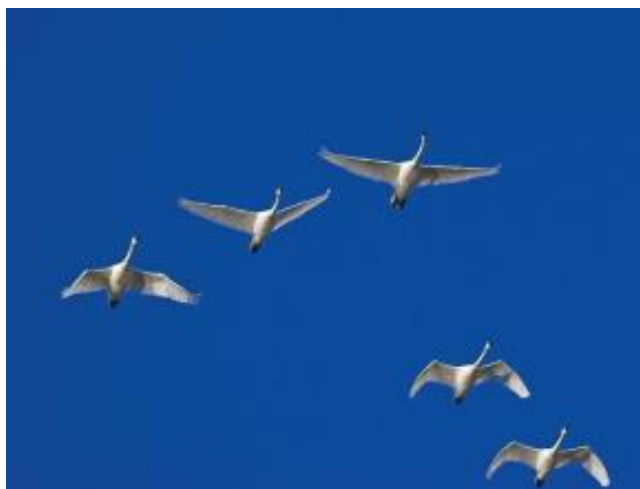
Trumpeter Swans in Flight