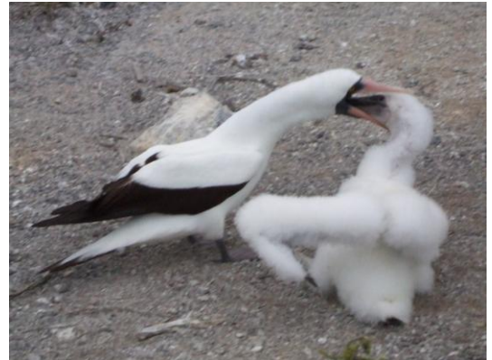
Masked Booby Feeding Young Galapagos Islands

Tuesday, February 8, 2011 7:00 Social, 7:30 Program Padilla Bay Interpretive Center 10433 Bayview-Edison Road Mount Vernon, Washington