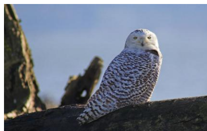
Snowy Owl