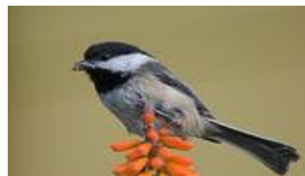
Black-capped Chickadee