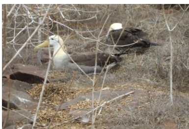
Waved Albatross