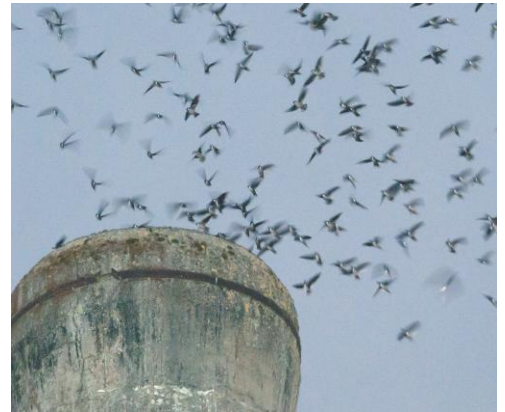
Vaux's Swifts at Old Northern State Hospital