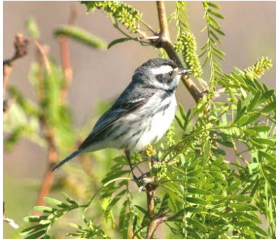
Black-throated Gray Warbler

Black-throated Gray Warbler 25+ at Howard Miller Steelhead Park, Rockport on 9-2-11 (RM)