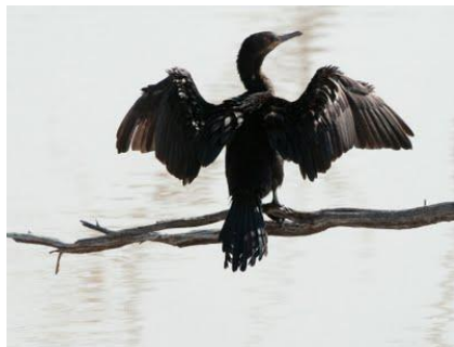
Double-crested Cormorant