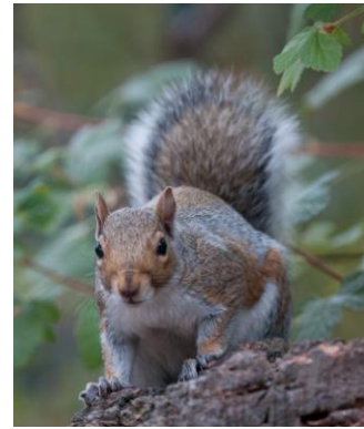
Eastern Gray Squirrel