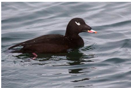
White-winged Scoter