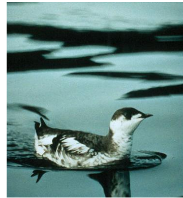
Marbled Murrelet