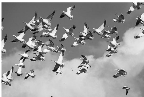
Snow Geese in the Skagit Valley

As I write this, a legislative committee in Olympia is considering a bill to eliminate the Growth Management Hearings Board and significantly reduce the effectiveness of the Growth Management Act. Without its protections, the habitats on which Swans, Dunlin, and many other species depend would be severely at risk, and that's just one of many bills being introduced attacking the Act. Also in the news lately is the proposed Keystone XL pipeline, unfortunately not entirely dead yet despite the many environmental threats the pipeline and tar sands oil extraction pose. Mining tar sands in Alberta directly reduces the boreal forest which supports an estimated 60% of Canada's landbirds, almost 30% of all landbirds in the U.S. and Canada combined, and millions of waterfowl, and that is only part of the problem. The price of the avian wonders we enjoy in Skagit County is our constant vigilance and readiness to protect them.