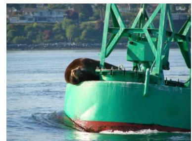
California Sea Lion