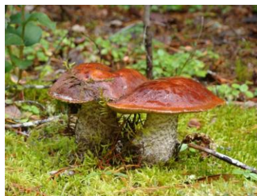
Leccinum Mushroom Species

Come travel around Washington with Phyllis and Ivar Dolph. You'll see boats (too many says Phyllis), birds (yeah!), flowers (too many says Ivar), mountains, and islands. We move quickly from Anacortes, to the Olympic Peninsula, Mt. Rainer, Mt. Baker, the Skagit Flats, and finally to Vendovi Island. We reached into our bag of photos and pulled out a few nice ones.