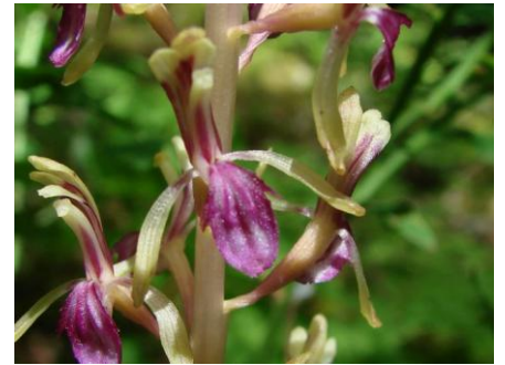
Western Coralroot

Tuesday, March 13, 2012 7:00 Social; 7:30 Program Padilla Bay Interpretive Center 10441 Bayview-Edison Road Mount Vernon, Washington