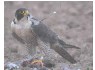
Peregrine with backpack GPS Satellite Transmitter

12 Nov. 2011: So after 53 days of migration , crossing through twelve countries (Canada, US, Mexico, Guatemala, Honduras, Nicaragua, Costa Rica, Panama, Colombia, Ecuador, Peru and Chile) and two hemispheres, and flying at least 8,628 miles (13,885 km) , “Island Girl” has completed her migration.