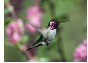
Anna's Hummingbird Photo by Joe Halton

Barn Owl babies begging for food in nest box near District Line Road, Burlington during April (JW)