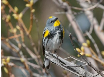
Yellow-rumped Warbler (Audubon Race)