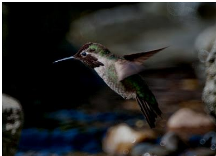
Anna's Hummingbird