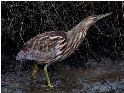
American Bittern On Fir Island, Skagit County