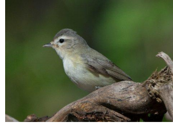
Warbling Vireo 1 at Padilla Bay Center on 9-7 (SAS)

Please submit your sightings to Pam Pritzl ppritzl@frontier.com or 360-387-7024 .