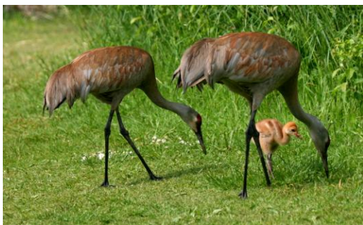
Sandhill Cranes

Peregrine Falcon 1 at Skagit Game Range on 10-4 (JB)