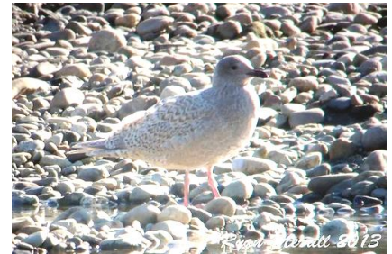
Iceland Gull: A Rare Skagit Visitor