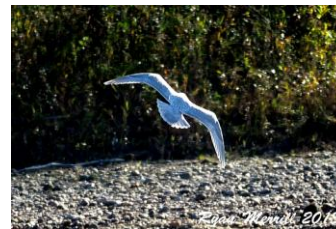
ICELAND GULL 1 first cycle bird at Howard Miller Steelhead Park on 10-2, Skagit County second record (RM)

Thayer's Gull 1 at Jensen Access on 10-28 (RM); 3 at Rosario Head on 10-28 (RM); 1 on Samish Island on 10-28 (RM); 1 at Martin Road on 10-29 (RM); 2 at Howard Miller Steelhead Park on 10-29 (RM); 1 at Lyman on 11-11 (GB)