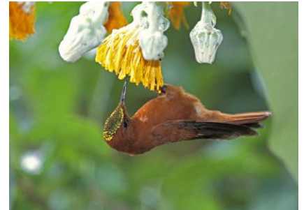
Juan Fernandez Firecrown Hummingbird

Tuesday, Feb. 11, 2014 7:00 Social; 7:30 Program Padilla Bay Interpretive Center 10441 Bayview-Edison Road Mt. Vernon, Washington