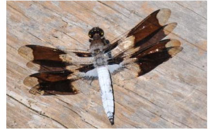
Common Whiteface Dragonfly

Tuesday, September 9, 2014 7:00 Social; 7:30 Program Padilla Bay Interpretive Center 10441 Bayview-Edison Road Mt. Vernon, Washington