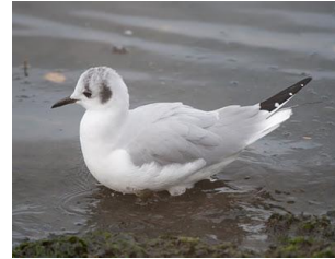
Bonaparte's Gull

Bonaparte's Gull 2 at March Point on 8-6 (GB)