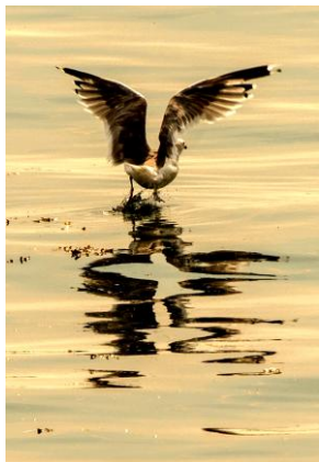
GULL TAKING OFF