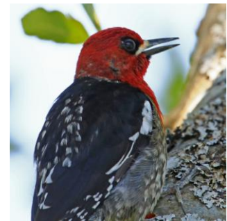
Red-breasted Sapsucker

Tuesday, December 13, 2016 6:45 Pot Luck; 7:30 Program Padilla Bay Interpretive Center 10441 Bayview-Edison Road Mt. Vernon, Washington