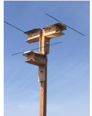
Purple Martin Project

This year our chapter took on a special project. The success of the Purple Martin Project is a chapter highlight for 2016. Volunteers built and installed 56 new nesting boxes. We now monitor 76 boxes in four different locations. Nearly all new boxes were used during the nesting season. This project was accomplished with the donation of supplies, talent and time. We had members with carpentry skills and tools volunteer to build the boxes. A local hardware supplier donated materials at cost along with many members donating supplies. Volunteers came out to install posts and the boxes on existing pilings. This project also included those dedicated to citizen science, monitoring Purple Martin activity at each site. There is more to do and fine-tune as this project continues into 2017.