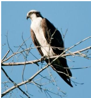
Osprey Returns Skagit Wildlife Area