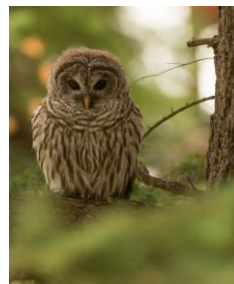
Barred Owl

Northern Pygmy-Owl 2 at Illabot Creek Road on 9-12 (GB) Barred Owl 1 at Illabot Creek Road on 9-12 (GB)