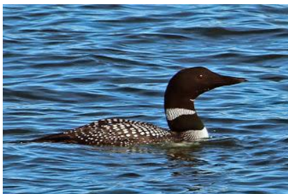
Common Loon "They're Back"