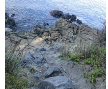
Washington Park Rocks, Fidalgo Island