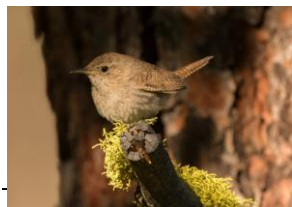
House Wren

House Wren 1 at Sauk boat launch on 8-15 (GB)