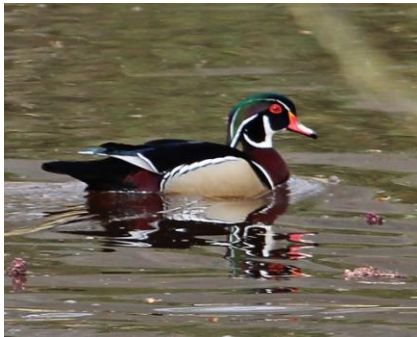
Male Wood Duck