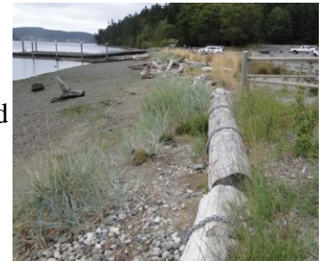
Cornet Bay: After