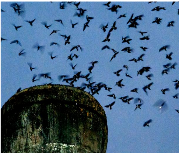
Vaux Swifts at Northern State Hospital Smokestack