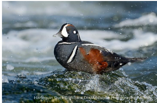
Harlequin Duck

Thinking about what to say at DOE's mid-September hearing on this proposed designation, I was recalling spring-time sightings of Harlequin Ducks on the Cascade River. Harlequins spend most of their lives in marine waters feeding along rocky shorelines on shellfish, amphipods, even chitons. But to breed they fly inland to rapid rivers where you can see their agile swimming and diving after aquatic insects and small fish. This striking duck nests on the ground or in a low cavity along these rivers but needs slow-flowing waters and small tributaries too. That's where the females lead the young to grow and learn to forage before going down to the sea. ORW designation of the upper Cascade, including both mainstem and tributaries, is a great opportunity to add protection to just the kind of habitat the spectacular Harlequin needs. We hope to hear a positive decision from DOE by year's end.