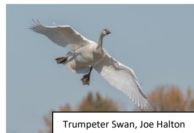
Trumpeter Swan, Joe Halton

If you see a dead, sick, or injured swan, call the Washington Department of Fish and Wildlife 24-hour hotline: (360) 466-4345, ext. 266. Do not handle the bird. Leave a short, detailed message with your name and phone number plus the location and condition of the swan(s). WDFW collects information to assess the impact of lead poisoning and power line collisions, the main causes of accidental swan deaths.