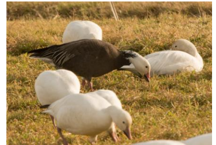
Snow Goose Dark Morph

Tuesday, December 8, 2015 6:45 Pot Luck; 7:30 Program Padilla Bay Interpretive Center 10441 Bayview-Edison Road Mt. Vernon, Washington