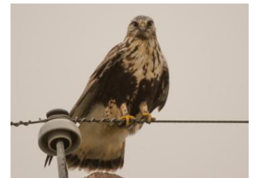
Rough-legged Hawk